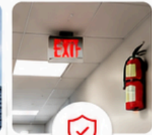
Life Safety & Compliance

Acquisition → Renovation → Stabilization → Ongoing CapEx